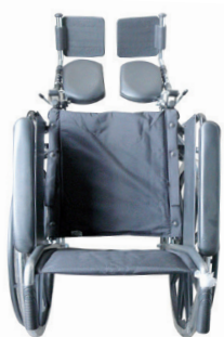
Correct Curb Approach

Curbs and other obstacles should be approached with caution. It is recommended that the wheelchair is driven around such obstacles wherever possible. If these obstacles cannot be avoided we recommend these are approached slowly and at 90° from the front or rear of the wheelchair.