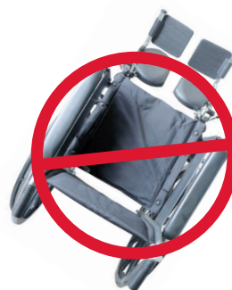
Incorrect Kerb Approach

It is very important to regularly check and service the wheelchair, ensure the brakes are working correctly and that all of the nuts and bolts are secure. Do not use the wheelchair if the brakes are not working correctly. You should keep the wheelchair clean and free from dirt, as this will prevent dirt and grim from causing damage to the wheel bearings, castor bearings and hinges.